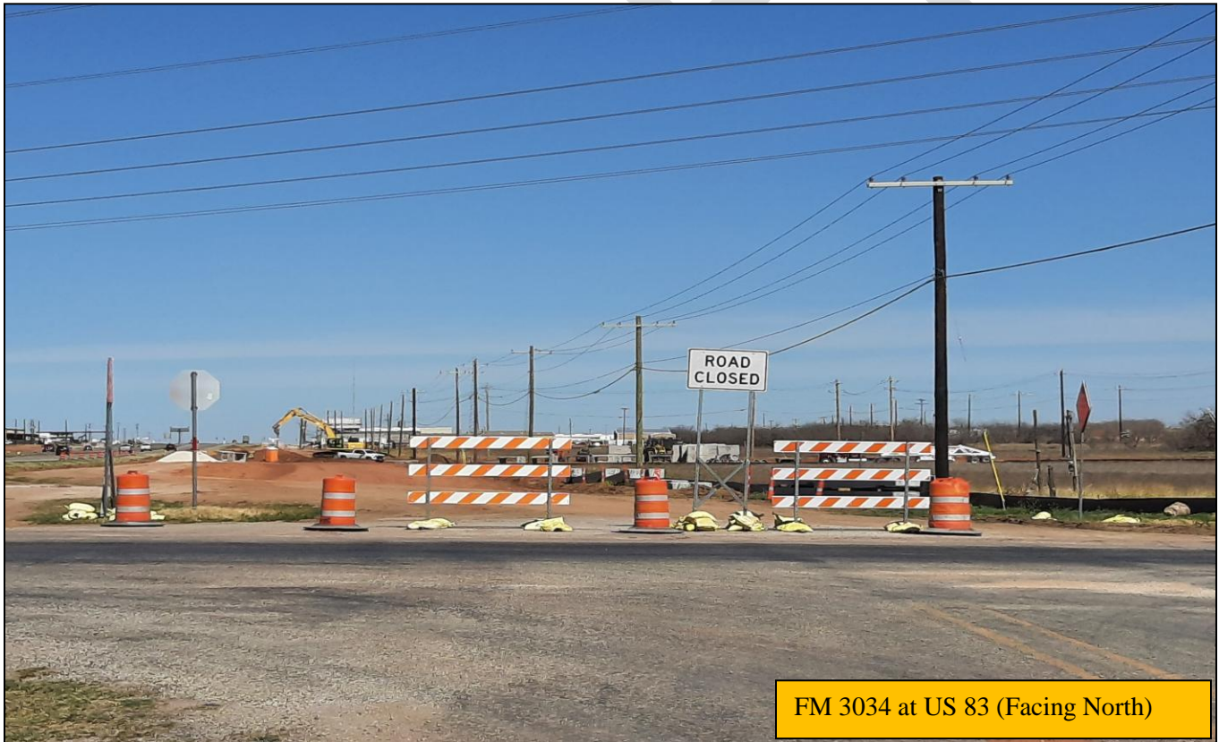
FM 3034 at US 83 (Facing North)

Report covers October 1, 2023 to September 30, 2024