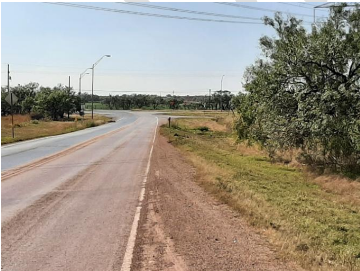
FM 3034 (Facing North in vicinity of new overpass) (03-24-25)