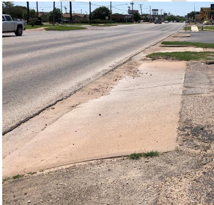
S 14 th St. Walkability Project (S14th at Sammons) (05-07-21)